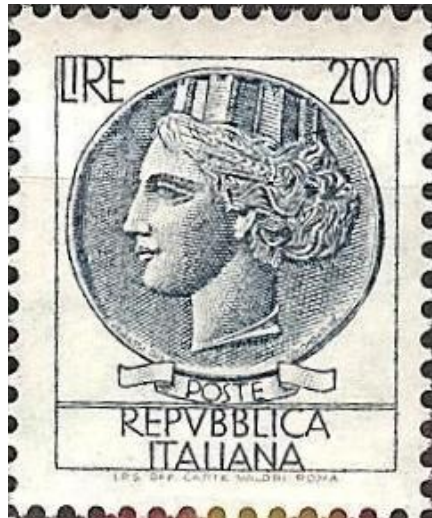
Genuine – Perforated 14