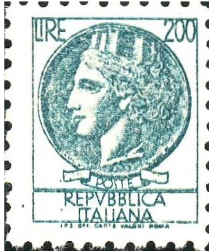
Forgery – Line perforated 10