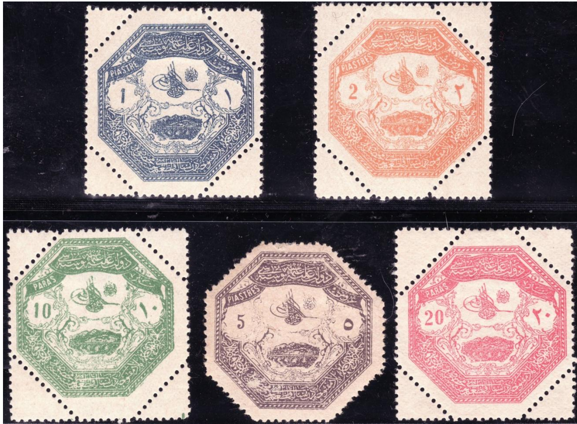
FORGERY COMPLETE SET PERFORATED 13.5 (Type 2)